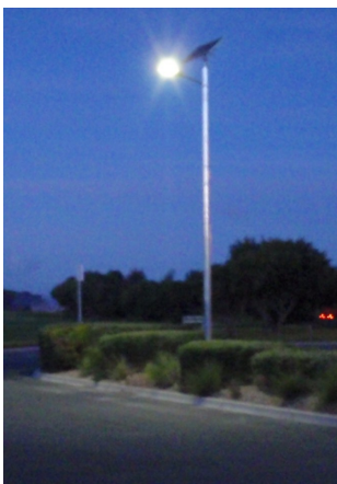
Car Parks, Recreational Reserves