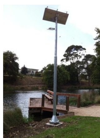
Parks & Gardens, Jetties