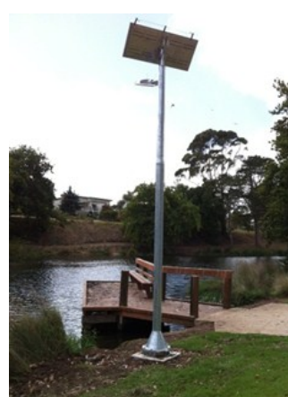
Parks & Gardens, Jetties