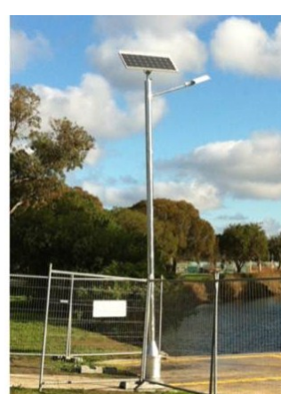
Parks & Gardens, Jetties