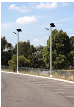
Car Parks, Recreational Reserves